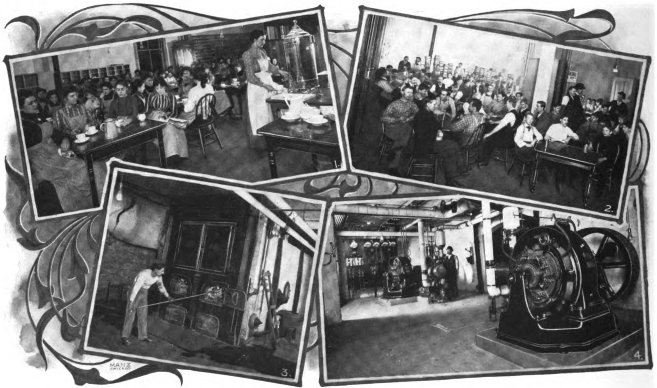
THE INLAND TYPE FOUNDRY'S NEW HOME.