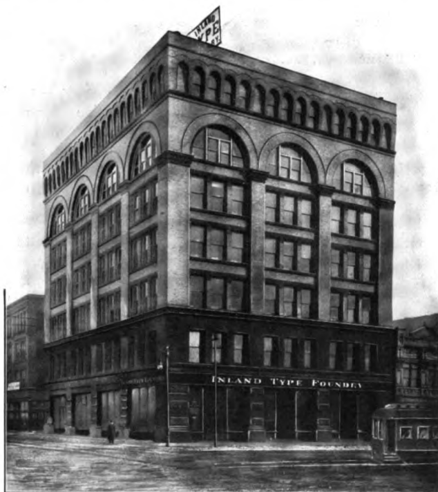
THE INLAND TYPE FOUNDRY'S NEW HOME.

On entering the general offices through the vestibule the visitor is met by a neatly uniformed usher, ready to give information or refer him to the proper party to expedite his business. Should he desire to see the manager he is shown into the private office of this gentleman. The furniture in this room is hand-made, of a peculiar heavy and handsome pattern. The leaded glass bookcases are filled with volumes of rare value devoted to the printing art, and the quiet harmony of everything can not fail to impress the caller with the high quality of the plant and the good taste of those who conduct it. Immediately adjoining this room is that of the president of the institution. On the same floor are the warerooms, finished like all the rest of the building, in golden oak. In these warerooms are long rows of type shelving constructed in a novel manner, with adjustable doors, somewhat like those in sectional bookcases. This arrangement keeps the packages clean, as the compartments are entirely dustproof. Here are also located the shipping and receiving departments, entirely cut off from the other parts of the business. This arrangement keeps the office clean and free from noise. In the rear