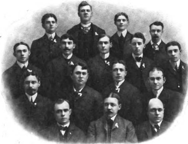
GROUP OF SALESMEN OF THE INLAND TYPE FOUNDRY.

A novel feature is the system of keeping track of all complaints, investigating them and fixing the blame where it rests. Whether it is the goods, service or employes which have come up for criticism, and whether the complaint seems founded on