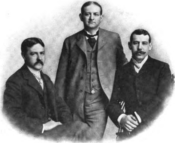
THE PROPRIETORS OF THE INLAND TYPE FOUNDRY.

far more time than the average printer thinks. After a letter is decided upon, many modifications are made before it finally passes muster and is ready for reproduction in various sizes. The foundry aims to get out all its faces in all of the useful sizes. When a face is designed it is often brought out in italic, extended, full face, condensed and extra condensed as well, thus insuring designs which are harmonious and will work well together. This requires an immense amount of work; more, in fact, than the founders ever get credit for. To the uninitiated, a visit to the engraving department is of prime interest. Entering the room, one